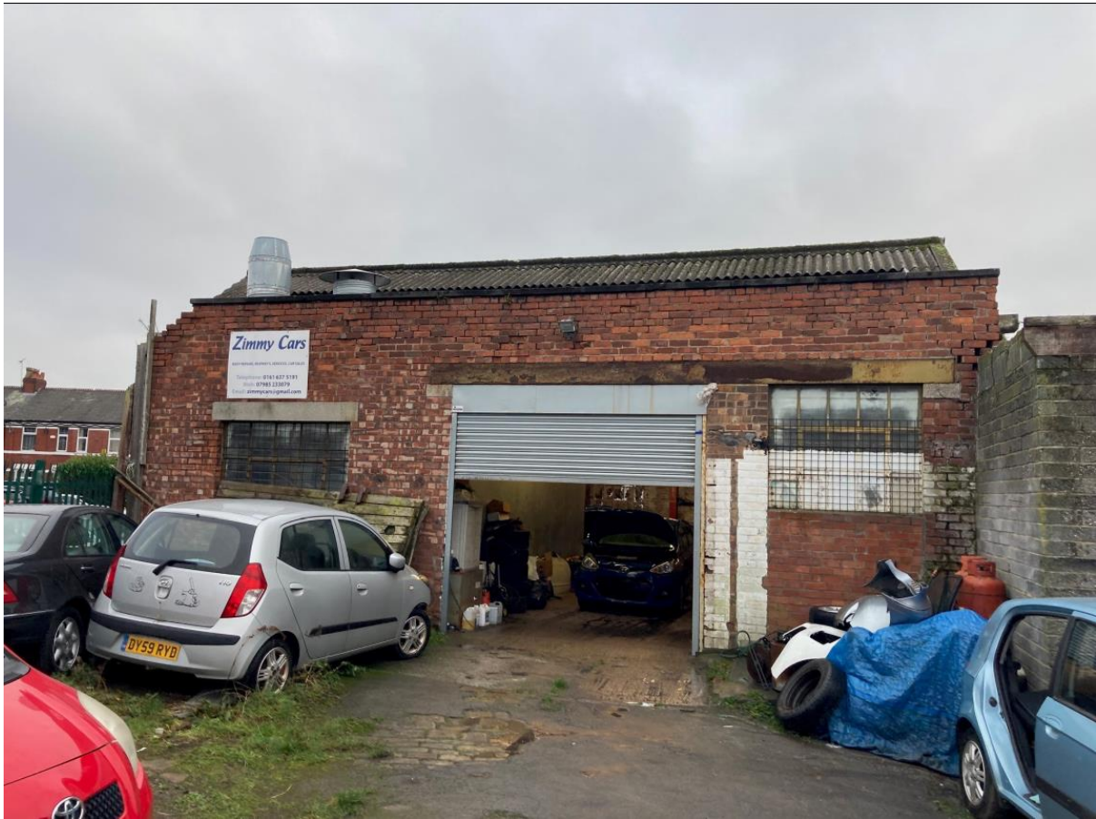
Photo 6: Partial demolition of building within site and works to adjacent building, looking west